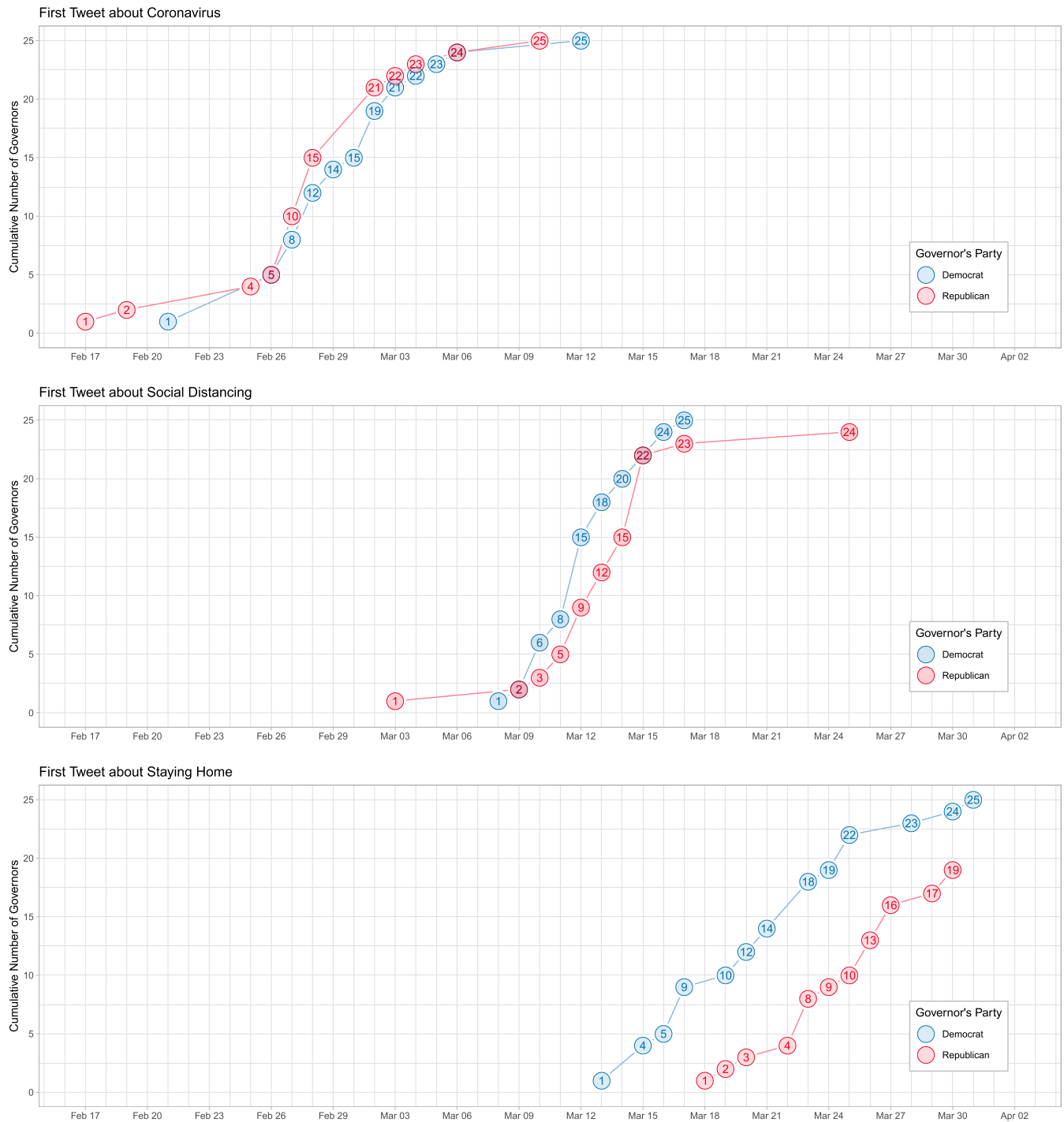
Fig. 1. Governors' tweets by topic. Figure shows the cumulative number of governors tweeting about coronavirus ( Top ), social distancing ( Middle ), and staying home ( Bottom ) by date and governor partisan affiliation. The governors of Alaska (Republican [R]), Florida (R), Georgia (R), Iowa (R), South Carolina (R), and South Dakota (R) did not tweet about staying home (shelter-in-place) during this time period.

Democratic-leaning counties than Republican-leaning counties (Table 2, Panel A, column 2). Our estimates indicate that a 10 percentage-point increase in President Trump's vote margin reduced the effect of governors' communications on mobility by about 1.7 min, or 10.7% of the effect size in a county where Clinton and Trump were tied in 2016. Nonetheless, the overall effect of governors' communications on mobility remained large and significant in both Democratic- and Republican-leaning counties ( SI Appendix, Fig. SI-10, Left and Table 2, Panel B).